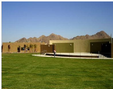
Civic Center Park Amphitheater