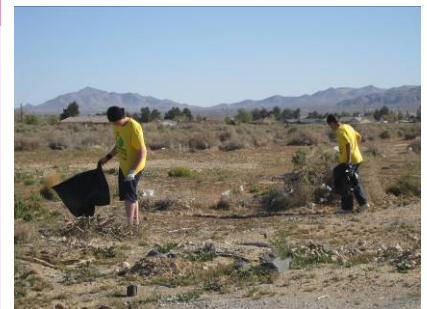
Community Clean-Up Day