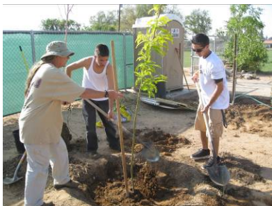
Volunteens working at the Paul Swick Community Garden