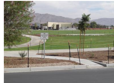
Civic Center Park