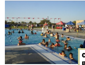
Creating recreational opportunities is a priority of the Foundation

Our Human Services Goal is to create programs that benefit families, individuals and children in need. The foundation supports programs that assist the elderly residents, low-income residents and persons with disabilities in the community.