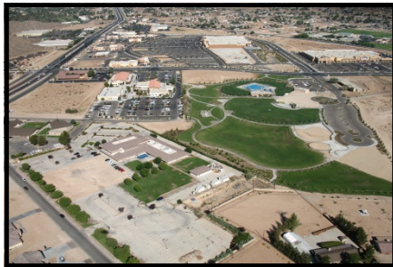
Supporting quality growth for a premiere community

The public and charitable purposes for which this corporation is organized are to lessen the burdens of government and to promote and support the cultural, recreational, and human services needs of the Town of Apple Valley.