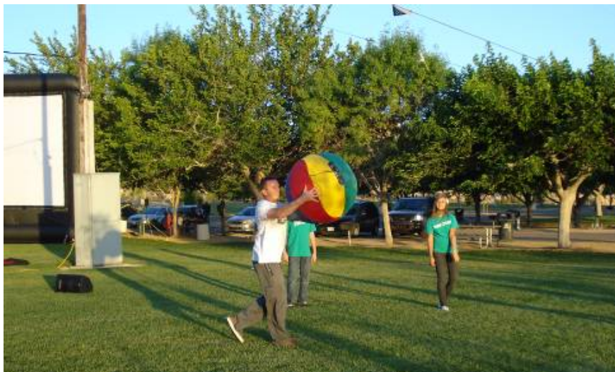
Teen Zone members conducting family games at Movie Night in the Park