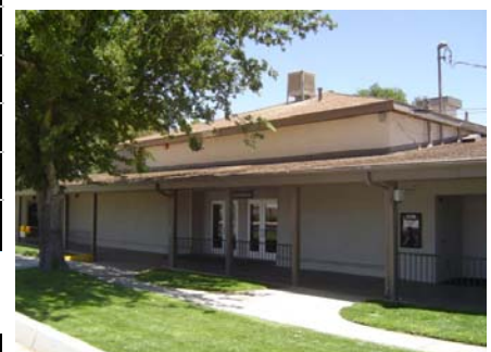
James Woody Community Center