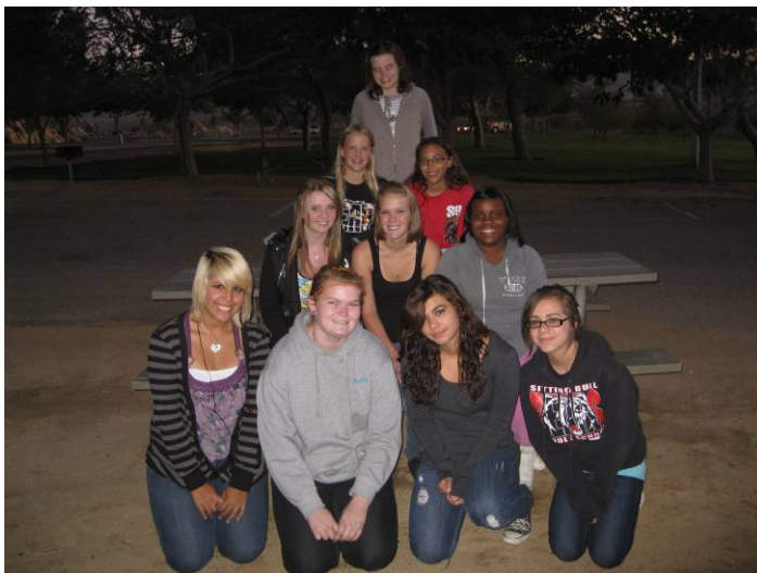
Teen Zone members