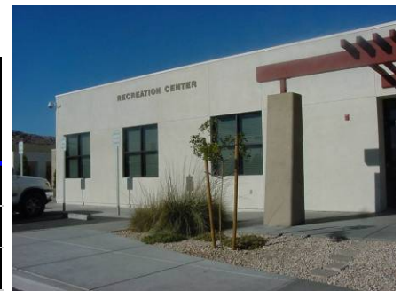
Town Hall Recreation Center