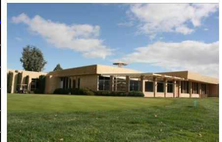
Apple Valley Country Club