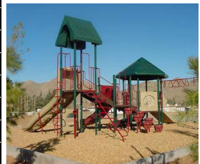
Mountain Vista Park