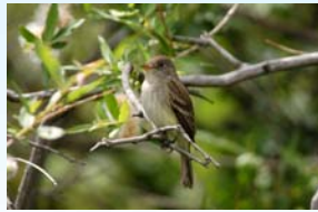
Southwestern Willow Flycatcher