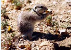
Mohave Ground Squirrel