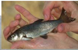
Mohave Tui Chub