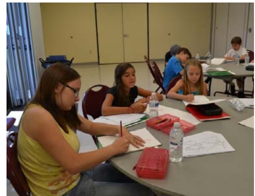
Summer Art Workshop