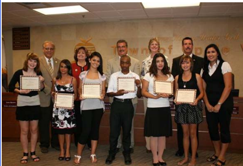
Six Teen Zone members were honored at a recent Town Council meeting for reaching at least 100 hours of community service. Nearly 150 teens have donated their time since the Teen Zone program was created four years ago.