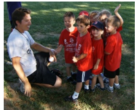
Adventures in Pee Wee Sports